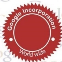
Larry Page Co-Founder & CEO